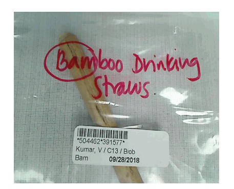
Package received - labeling COC

Atmospheric adjustment factor (REF) 100.5; = pMC/1.005