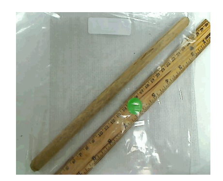
View of content (1mm x 1mm scale)