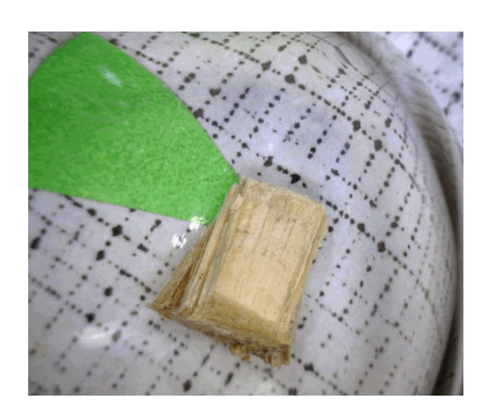
13.7mg analyzed (1mm x 1mm scale)

Disclosures: All work was done at Beta Analytic in its own chemistry lab and AMSs. No subcontractors were used. Beta's chemistry laboratory and AMS do not react or measure artificial C 14 used in biomedical and environmental AMS studies. Beta is a C14 tracer-free facility. Validating quality assurance is verified with a Quality Assurance report posted separately to the web library containing the PDF downloadable copy of this report.